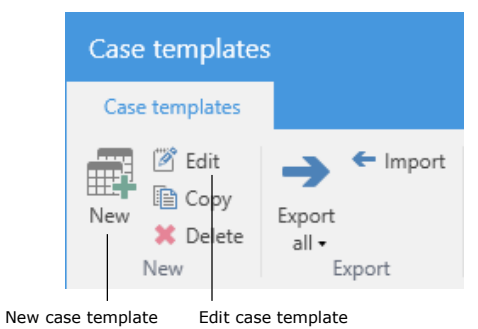
Figure 19: The ribbon in "Case templates"

To open the case template window, click New or Edit in the ribbon while an existing case template is selected.